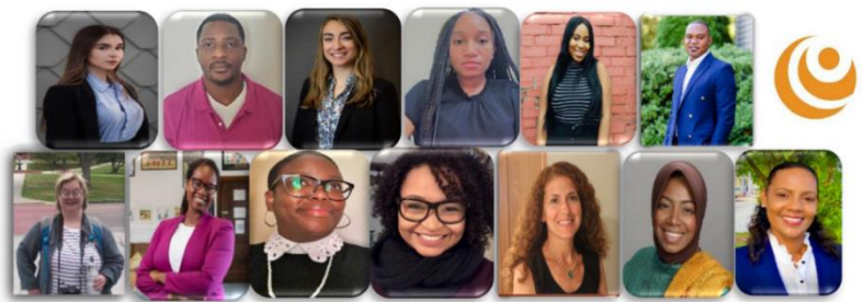
VT LEND Trainees and Fellows (T/Fs) 2020-2021