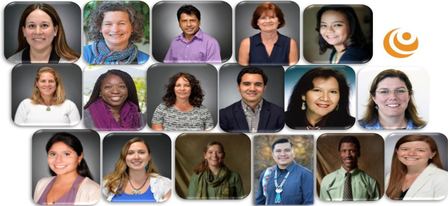
VT-LEND Interdisciplinary Faculty and Staff

AUCD conference: 4.5 days virtual or in Washington DC Trainings on range of disability topics. Meetings with legislators.