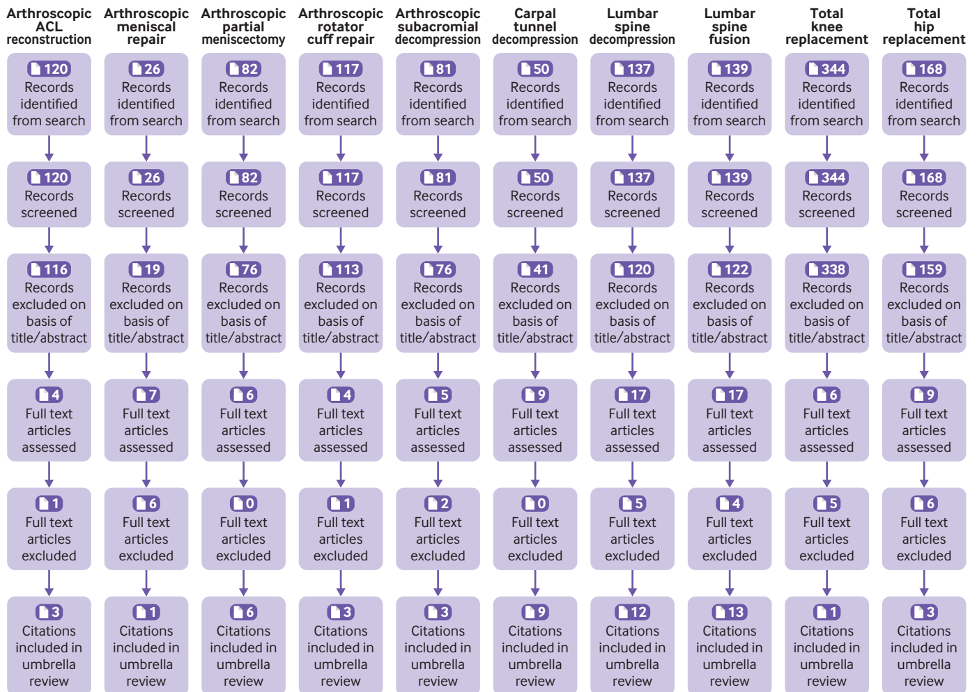
Fig 2 | PRISMA flow diagram. ACL=anterior cruciate ligament

cruciate ligament reconstruction) with non-surgical treatment. The third was a Cochrane review, which evaluated one randomised controlled trial. All three reviews in their pooled analyses showed no difference