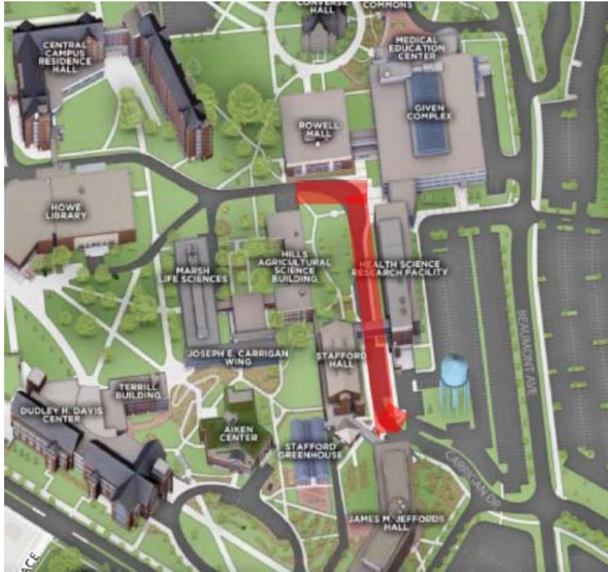
Figure A: Carrigan Drive Closure