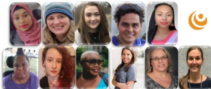
VT LEND Trainees and Fellows (T/Fs) 2021-2022