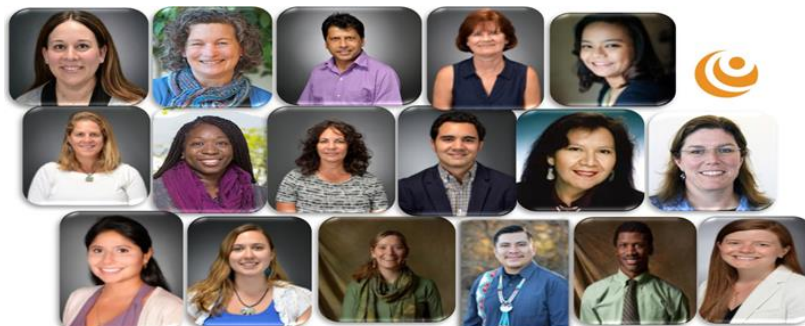
VT-LEND Interdisciplinary Faculty and Staff

Trainings on range of disability topics. Meetings with US Congress members or staff.