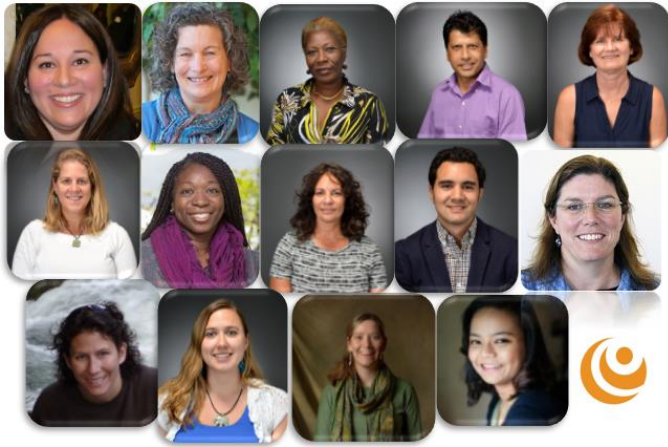
VT-LEND Interdisciplinary Faculty and Staff