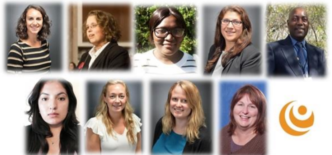
VT LEND Trainees and Fellows (T/Fs) 2017-18