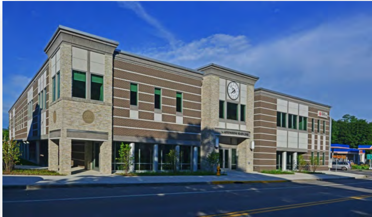
Warrensburg Health Center