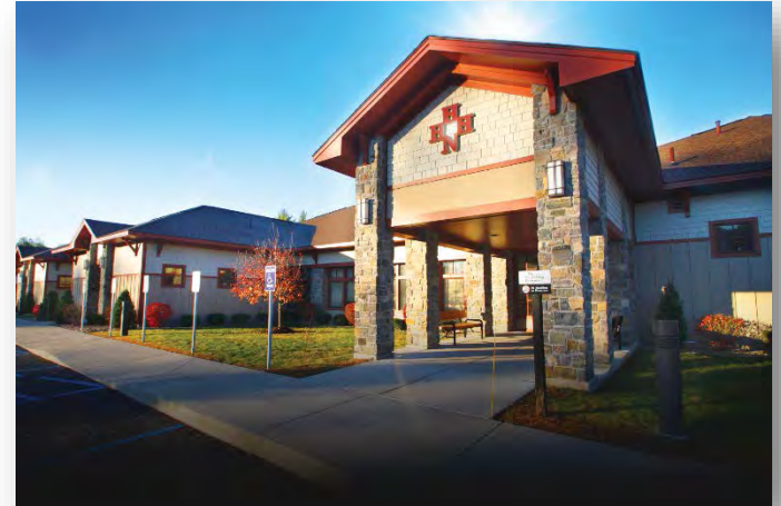
West Mountain Health Services