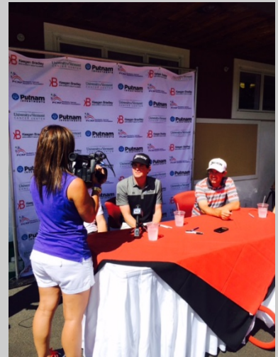
Keegan Bradley and John Curran at the 2016 Charity Golf Classic

Funds raised from the event will benefit pediatric cancer research at the UVM Cancer Center. Annually, the event has raised more than $100,000 and engages hundreds of donors, sponsors and volunteers from around New England. Included in the tournament is a complementary golf clinic with PGA golfers Keegan Bradley, Jon Curran and Brendan Steele.