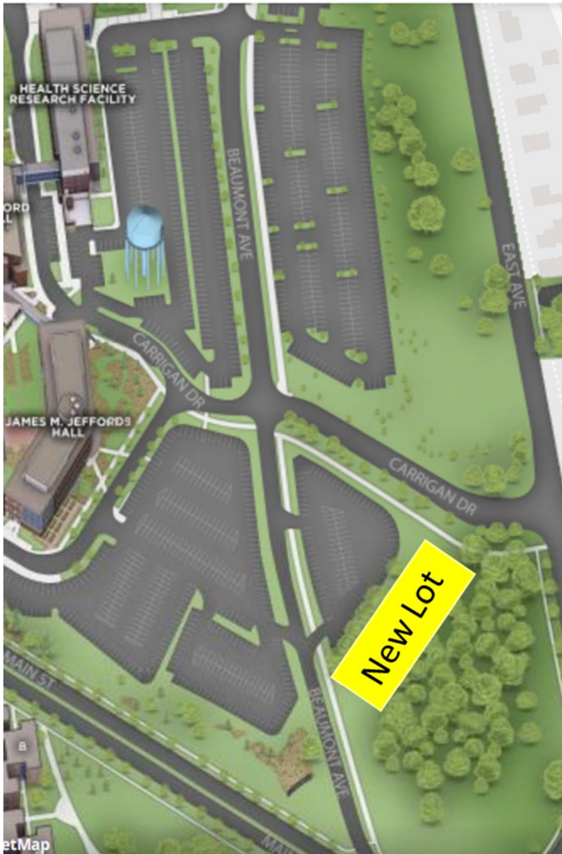
Figure A – New Jeffords East Parking Lot: