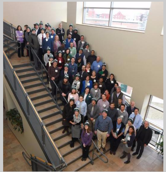
2017 UVM Cancer Center Member Retreat